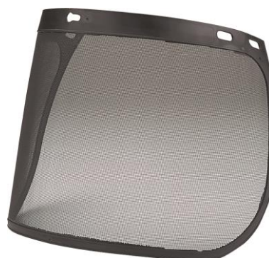
B925 w/plastic rim